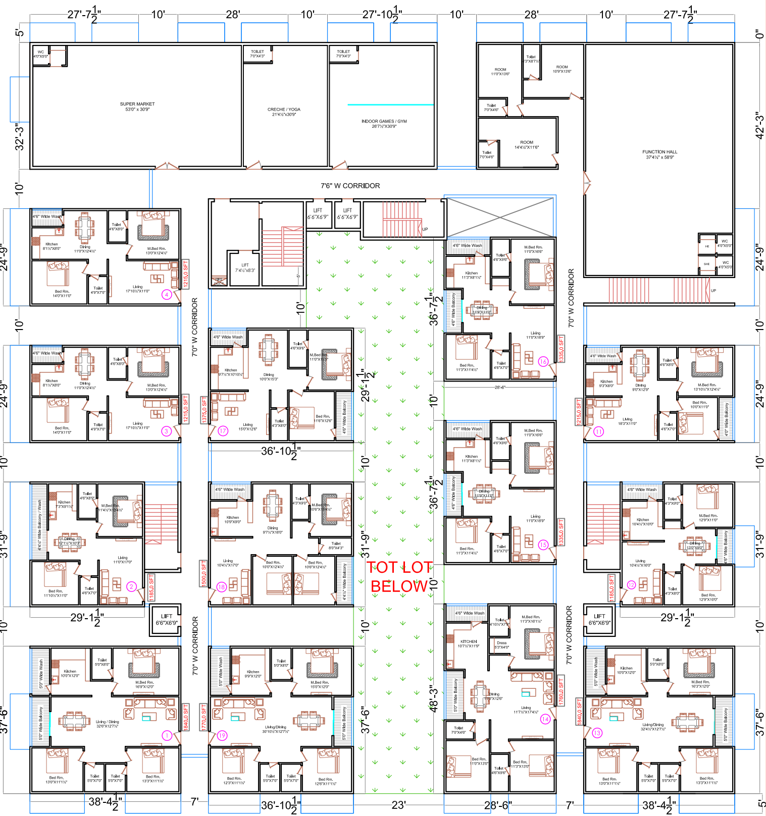
TYPICAL FLOOR PLAN (1ST FLOOR)