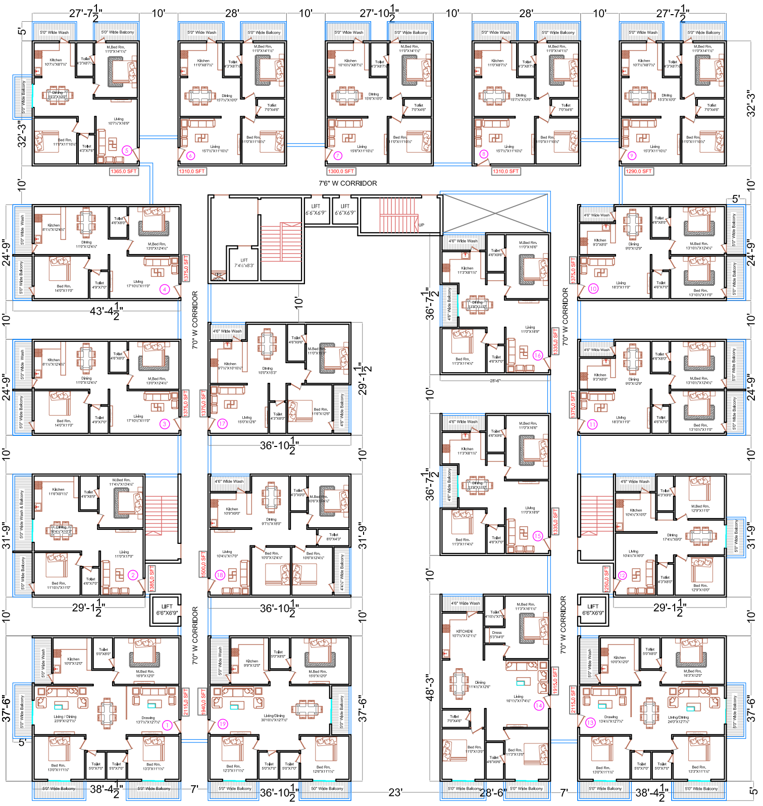
TYPICAL FLOOR PLAN (2ND TO 8TH FLOORS)