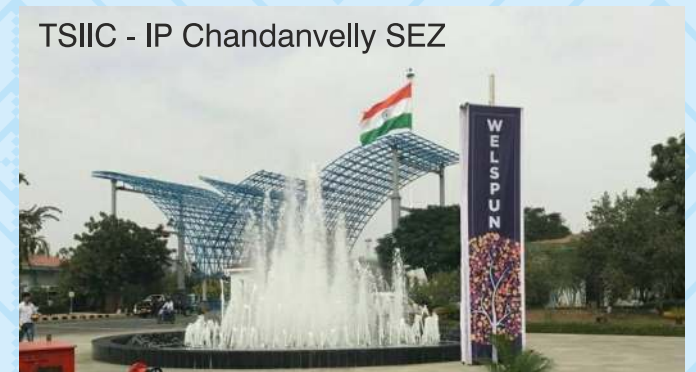
TSIIC - IP Chandanvelly SEZ