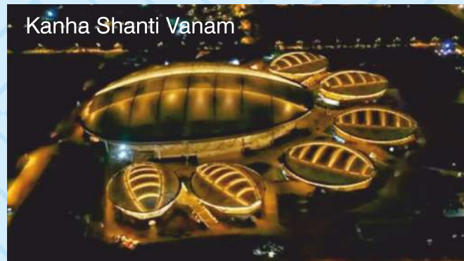
Kanha Shanti Vanam